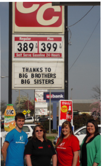
CC Food Marts helped us to recognize Volunteer Appreciation Month using their signs!

▶ Holland Construction Klondike Classic Golf Tournament